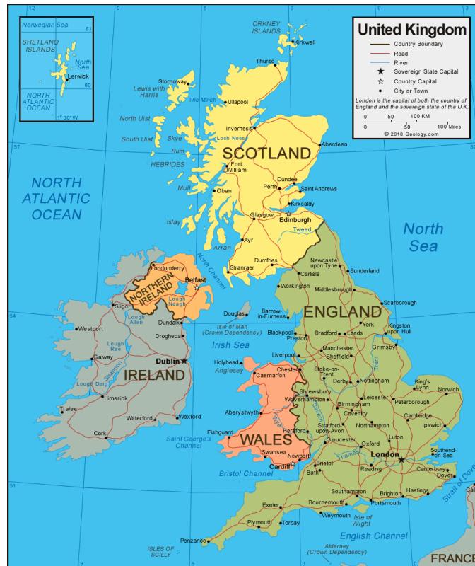
UK Map with Other Cities