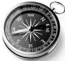
Compass and Compass Directions