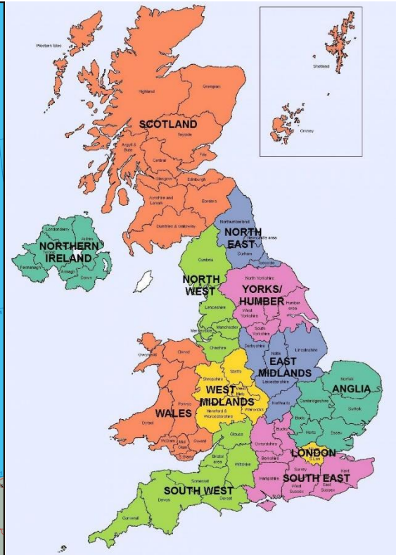
Regional UK Map