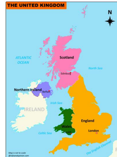
UK Map (Countries and Seas)