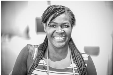
Dr Maggie Aderin-Pocock