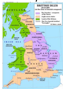
Areas that Vikings ruled