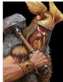
Popular God was Thor

Vikings believed that there were lots of different gods. The most popular God was Thor.