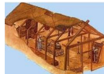
Rectangular Viking house