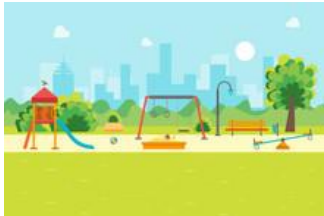
Somewhere you spend your free time