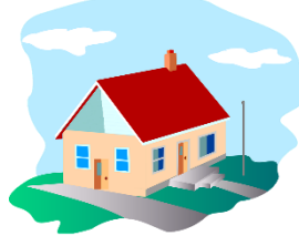
At home or at a friend's house