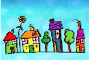
In the street