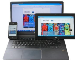
On your tablet, computer or mobile phone

For the older children at River Bank Primary, there are people outside of school who you can contact, if you prefer.