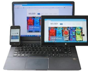
On your tablet, computer or mobile phone

For the older children at River Bank Primary, there are people outside of school who you can contact, if you prefer.