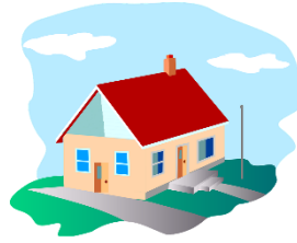
At home or at a friend's house